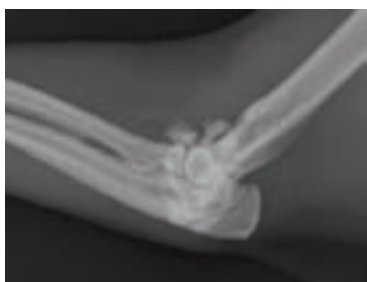
Figure 3: Elbow osteoarthritis in an 11-year-old Burmese cat. There are peri articular osteophytes and joint mice. Bilateral elbow changes were present.

Veterinarians globally report that decreased agility and reduced mobility are the most common signs reported to them for cats diagnosed with OA. Behavioural changes are also common and usually associated with the cats' decreased agility and reluctance to move around. 5,6 Cats presenting with behavioural problems can be easy to miss and is another reason to screen all cats for OA around seven to 10 years of age. These findings are in line with published studies on feline OA.