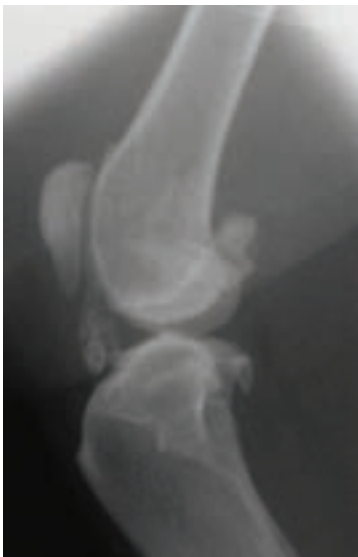
Figure 4: Mineralisation of the intra-articular structures in the stifle of a seven-year male neutered cat. There is also mild periarticular osteophytosis of the stifle with new bone on the proximal pole of the patella and trochlear ridge.

Although the combination of appropriate clinical signs and physical examination findings may lead you to be fairly certain a cat has OA, it is ideal to try to confirm your suspicions by seeing radiographic changes. The primary radiographic change associated with osteoarthritis is the presence of periarticular osteophyte formation, although this is not always present or easily identifiable in every case. It is important to appreciate that osteoarthritis may be present in the absence of obvious radiographic changes. Contrarily, the presence of radiographic changes does not always correlate with clinical signs of OA nor the degree of pain suffered. Occasionally, cats develop excessive periarticular mineralisation and ossified bodies adjacent to their joints, particularly in the stifle joint (see Figure 4).