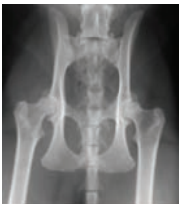
Figure 2: Hip osteoarthritis in an eight-year-old domestic short-haired cat secondary to hip dysplasia. Large bilateral osteophytes are present on the cranial acetabulum.

Degenerative joint disease refers to damage in both the appendicular and axial skeletal systems, with most of the cases diagnosed as osteoarthritis. OA implies a joint problem, primarily associated with degeneration and loss of cartilage and proliferation of bone in the form of osteophytes around the joint. This results in a joint that has a reduced range of motion and one that is undergoing low grade inflammation resulting in varying degrees of pain and swelling of the offending joint(s). It is common in cats where multiple joints are impacted. In cats, OA usually occurs as a primary problem with no easily identifiable underlying cause, but it can also occur secondary to underlying developmental joint disease such as hip dysplasia (see Figure 2) or subsequent to a joint injury such as an intra-articular fracture or luxation. Cats develop osteoarthritis in all their large joints, but particularly the hip, hock and elbow joint 3,4 (see Figure 3). Over 80% of cats older than 12 years of age had axial skeletal changes. 4 Appendicular skeletal changes are even more common with over 90% of cats of all ages having radiographic changes in at least one joint. 3