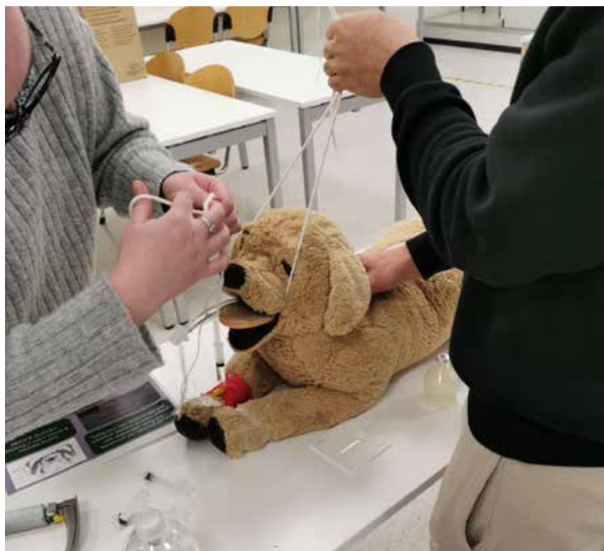
A canine model fitted with I/V catheter, trachea and oesophagus to simulate induction of anaesthesia and intubation.