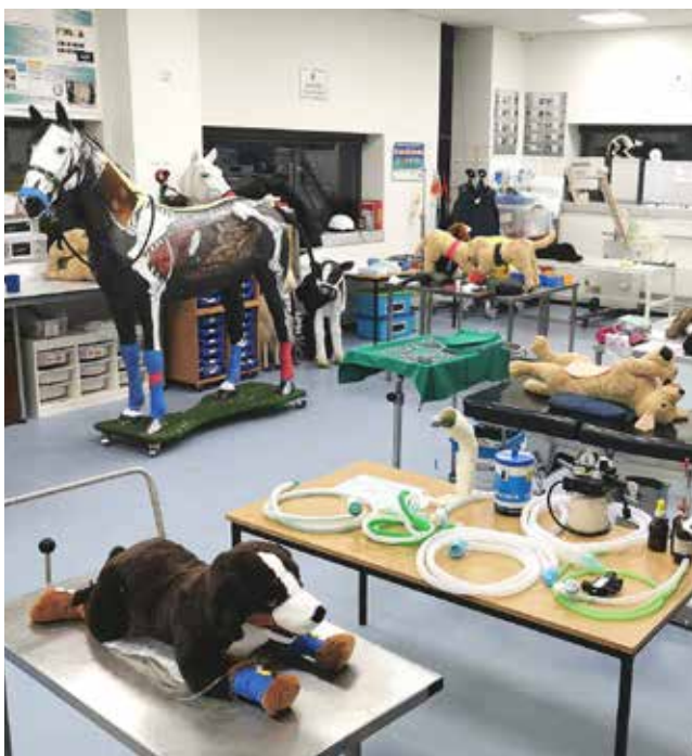
The Clinical Skills Centre in the School of Veterinary Medicine, UCD.