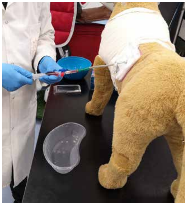
A standing canine model with a placed chest drain to allow for fluid removal and three-way tap management.