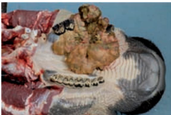
Figure 2 Oral mass protruding from the right maxilla.

Culturing of samples taken from the mucopurulent nasal discharge isolated the following bacteria and fungi: Trueperella ( Arcanobacterium pyogenes ), Pseudomonas aeruginosa , Staphylococcus epidermidis , Streptococcus spp. , and Candida spp. A small superficial section (1 × 1 cm) of the mass was removed for bacteriological and histopathological examination. Culture results of the mass indicated sparse cultures of Streptococcus spp. , Staphylococcus epidermidis and Weeksiella virosa . Histological results showed infiltration of fibrous tissue with inflammatory cells, many of which contained bacteria. No signs resembling Actinomyces bovis were found, sulphur granules were not observed. Neoplastic cells were also not observed in this initial tissue sample.