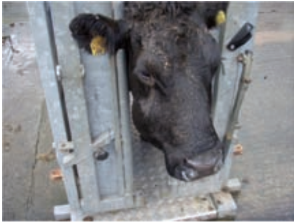
Figure 1 Unilateral facial swelling in a 10-year-old Limousin cross cow.

concentrations were slightly elevated; the albumin/globulin ratio was decreased. No abnormal findings were reported on bacteriology and parasitology of a faecal sample. Bovine virus diarrhoea (BVD) antibody detection was positive but virus detection was negative. Johne's disease serology was negative.