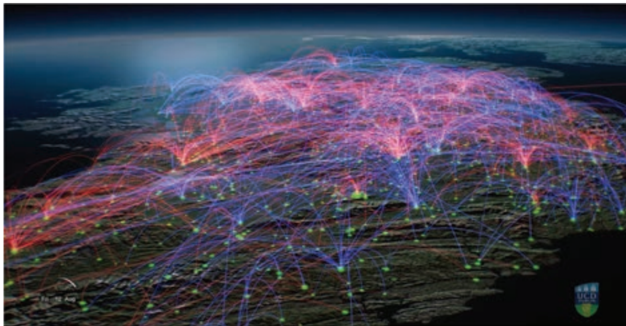
Fig. 3 Screenshot of cattle movement events in Ireland, in this case from 12 August 2016. From McGrath et al. [50]. The blue lines depict movements to slaughter or export, and the red lines from farm to farm including via a mart. The movement video is available on YouTube at https://youtu.be/PTCdPMnenBw

this is not always the case risk has been overestimated; conversely, potential for latency (animals becoming infected following exposure but passing at least one test following introduction) was not considered, if it were important, risk has been underestimated [54]. Three different approaches have been used to overcome these concerns, although none has yet in Ireland. Firstly, modelling studies have been used in the UK to quantify source attribution in TB restrictions. In one study, 16% of TB restrictions were attributed to cattle movement [56] whereas another study suggested 13% attributed to cattle movement alone plus 40% to the combined effect of movement, transmission from the environment (including wildlife), and residual infection [57]. Secondly, WGS has been used in several countries to assist with source attribution [40–43]. Finally, in Australia, source attribution (both cattle movement and residual infection) become increasingly clear during the latter stages of the eradication programme as case numbers fell [16].